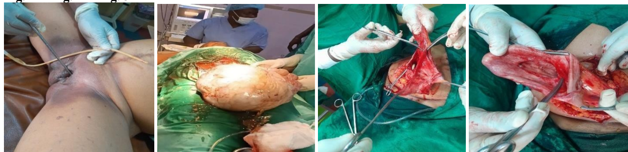
Fig. 4 Fig. 5a Fig. 5b Fig. 5c