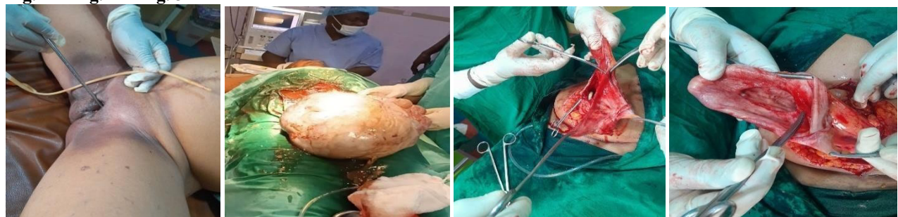
Fig. 4 Fig. 5a Fig. 5b Fig. 5c